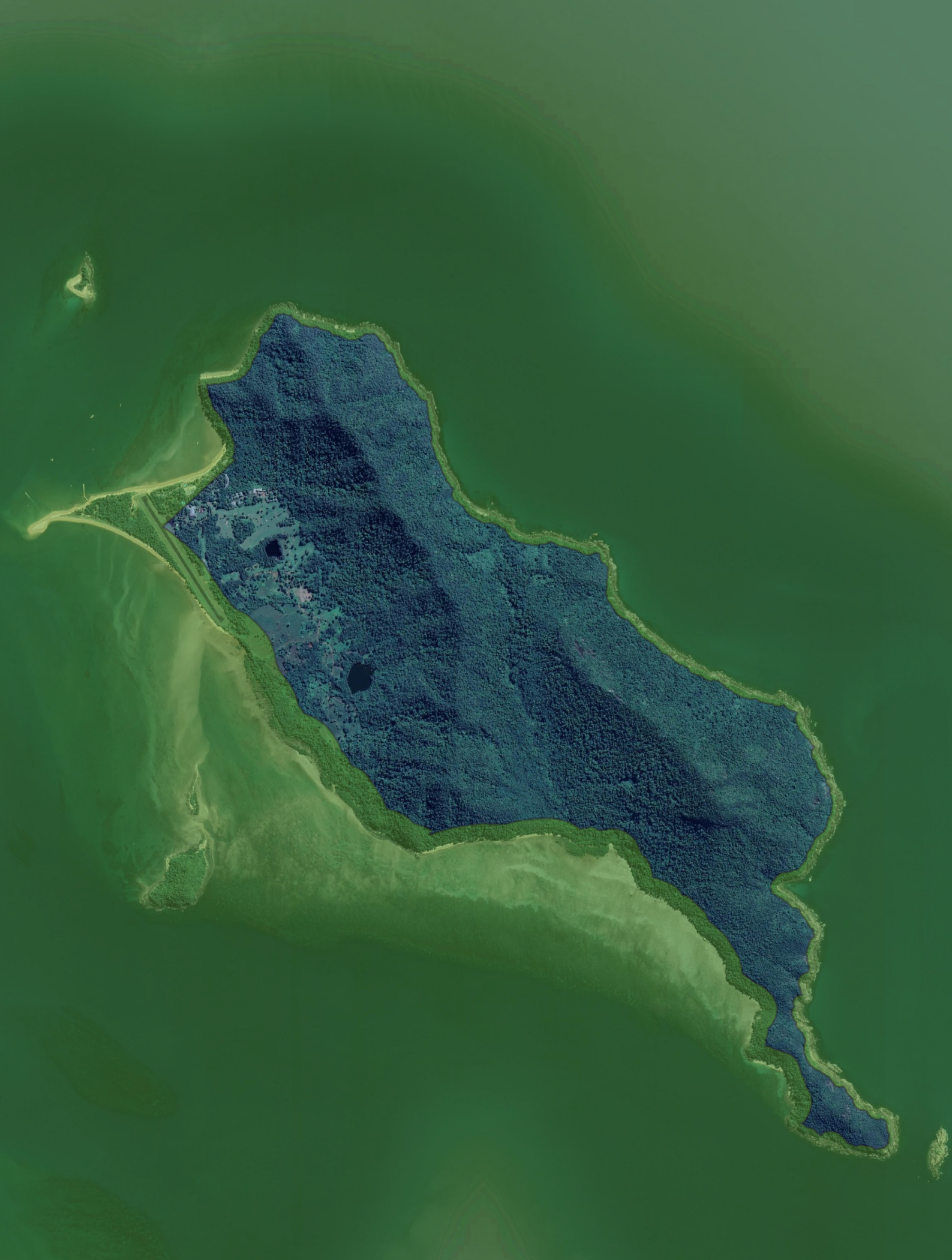
Dunk Island Coastal hazards at 2100