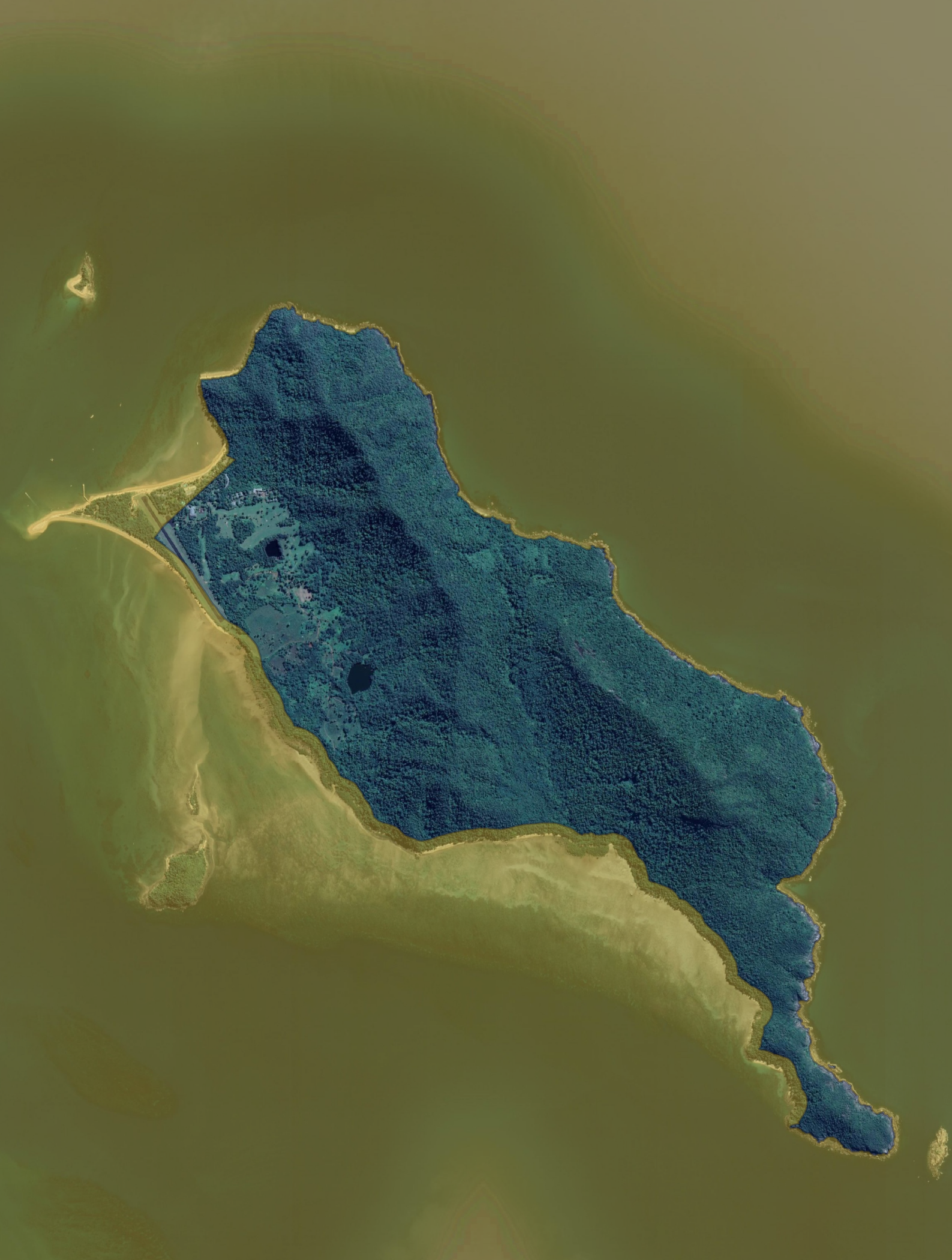
Dunk Island Coastal hazards at present