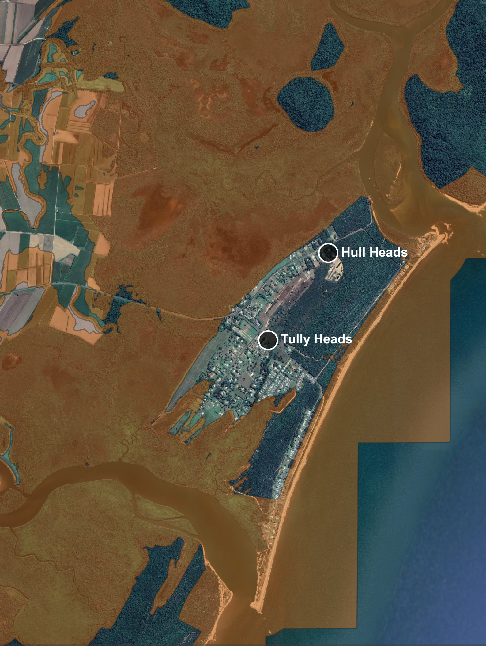
Tully Heads and Hull Heads Coastal hazards at 2050