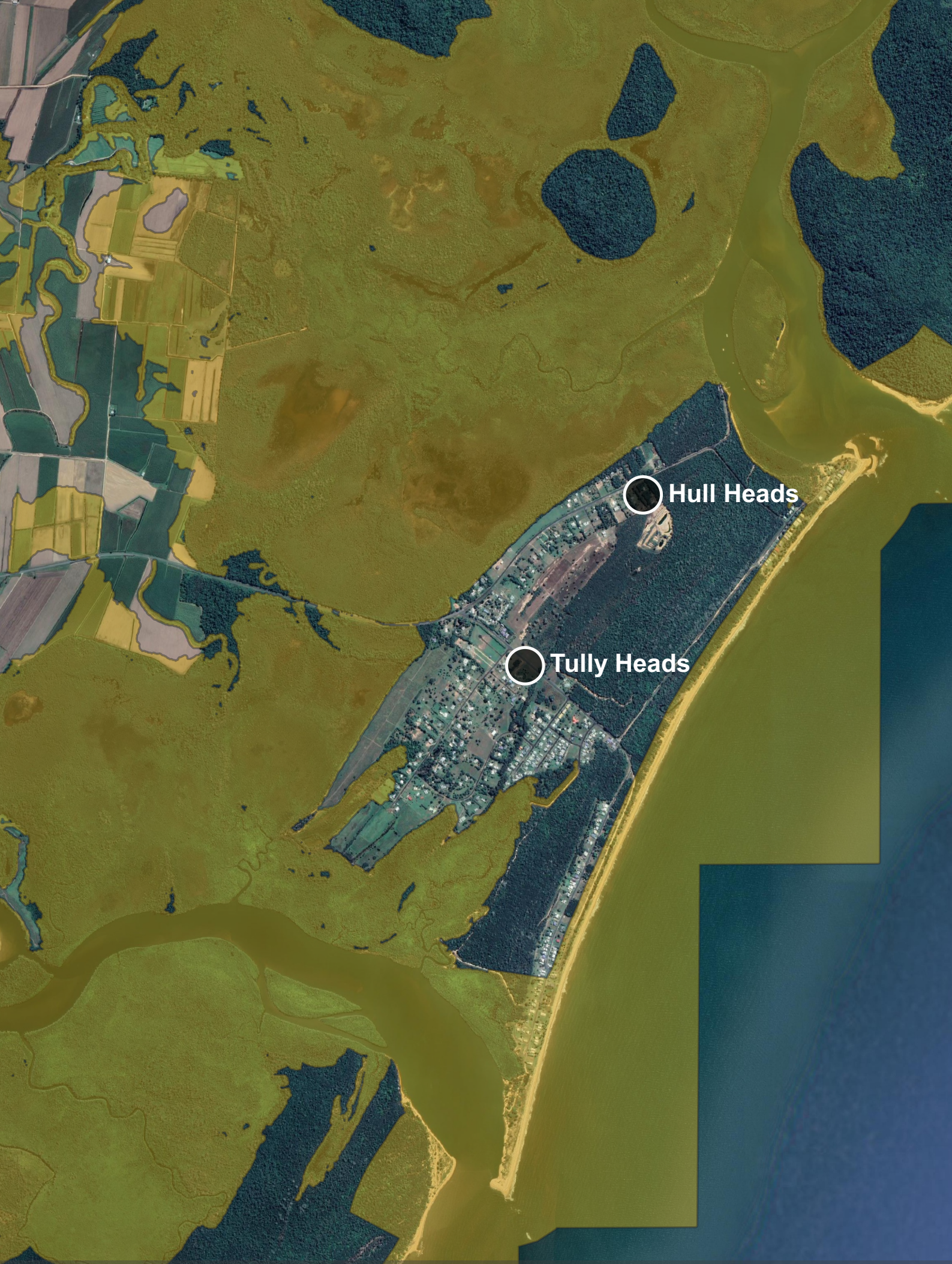
Tully Heads and Hull Heads Coastal hazards at present