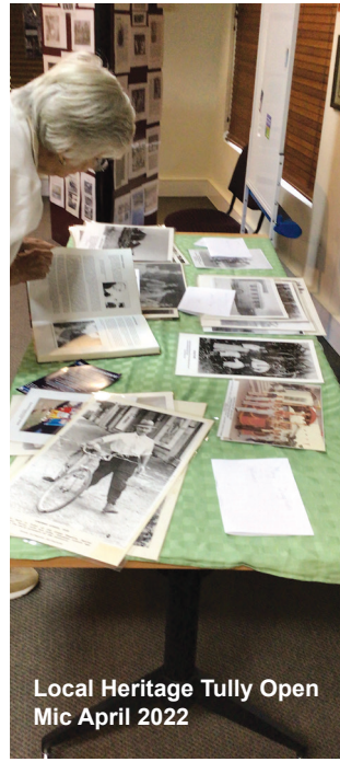
Local Heritage Tully Open Mic April 2022