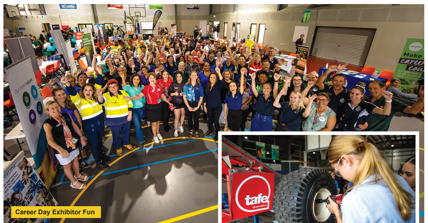
Career Day Exhibitor Fun

Cassowary Coast Regional Council had team members in attendance from departments such as