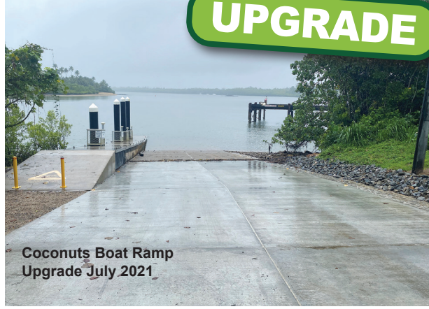
Coconuts Boat Ramp Upgrade July 2021

Cassowary Coast Regional Council will be undertaking upgrades to the car and trailer parking at the Coconuts Boat Ramp, located on Fern Avenue, Coconuts. The upgrades are expected to begin on Monday 27 June, pending weather conditions, and will be undertaken by local contractors. The project involves upgrading the existing roadway (from Fern Avenue towards the cul-de-sac end) to a two-way sealed standard including a turn-around area, provision of a formalised car parking area for cars and trailers, and a designated pedestrian pathway connecting the boat ramp to the car parks. The construction work will be carried out in stages and is expected to be complete by the end of August.