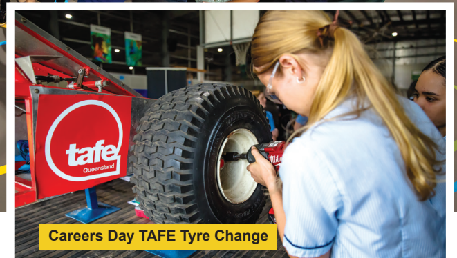
Careers Day TAFE Tyre Change

Council wishes to thank all vendors, businesses and individuals who were involved in the coordination to create a successful and educational event for the students who attended.