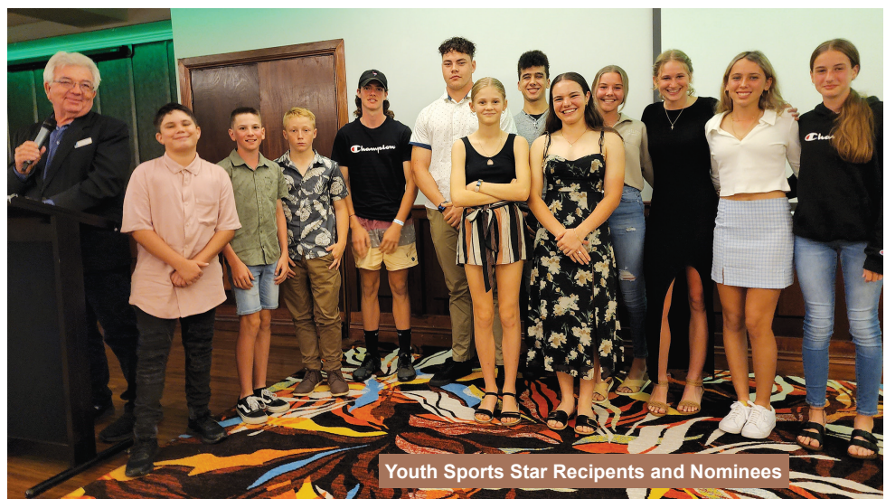
Youth Sports Star Recipients and Nominees