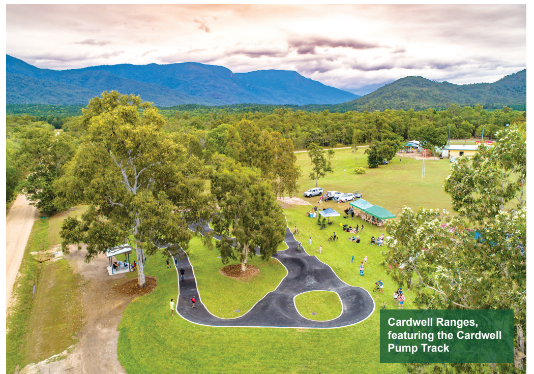
Cardwell Ranges, featuring the Cardwell Pump Track

For more information on the Cardwell Tropical Mountain Bike Trail Project visit: https://bit.ly/3bNPZoE