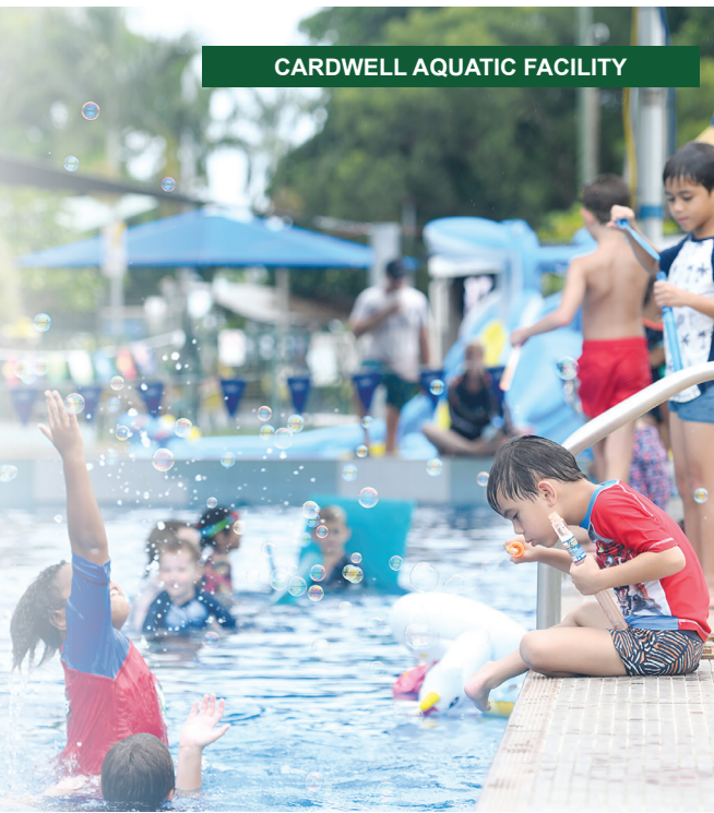
CARDWELL AQUATIC FACILITY

Council has easy to use instructions and FAQ's to assist with how to lodge tenders available on our website. You can find this information by visiting https://bit.ly/3rC4iBg