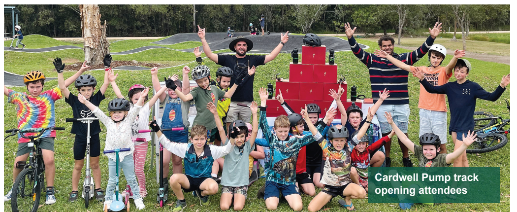
Cardwell Pump track opening attendees