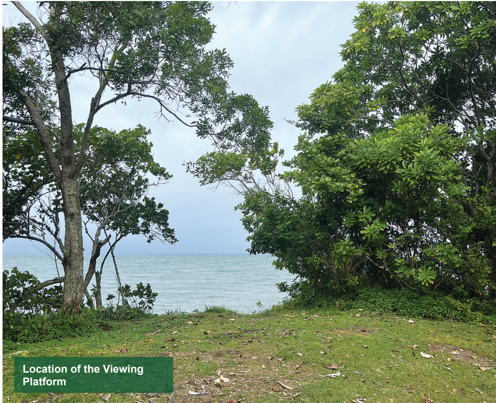
Location of the Viewing Platform

Weddings and other events will soon be able to take advantage of the picturesque scenery of Flying Fish Point with a new project soon to commence.