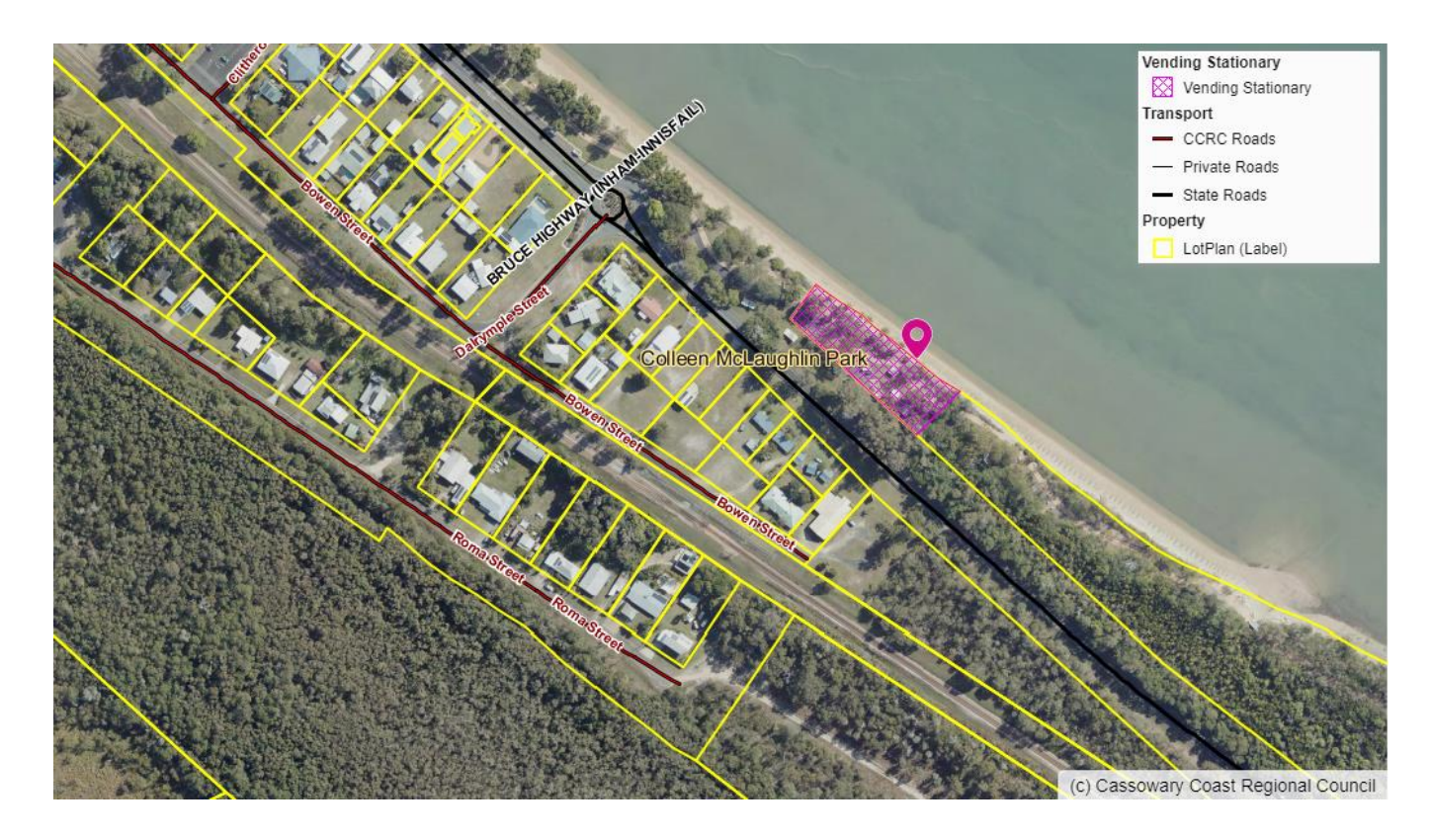
Map 1 Colleen McLaughlin Park, Victoria Street Cardwell, Lot 54CP800802