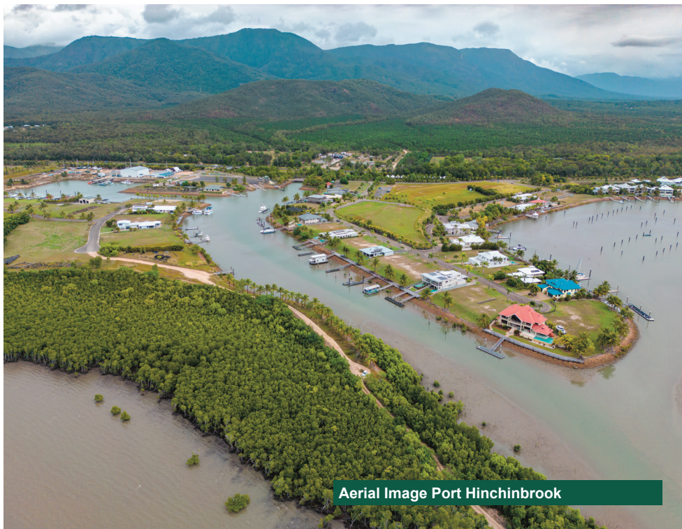
Aerial Image Port Hinchinbrook

Council apologises for any interruptions this may cause and will look to have the work completed as soon as possible.