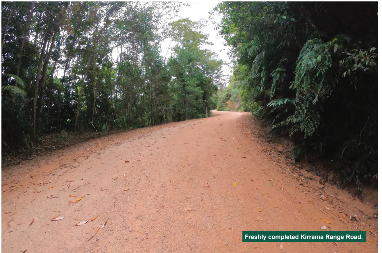
Freshly completed Kirrama Range Road.

For more information please contact Cassowary Coast Regional Council on 1300 763 906 or email enquiries@cassowarycoast.qld.gov.au .