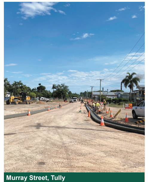
Murray Street, Tully

In conjunction with the Murray Street works, concerns were brought to Council's attention after inconsistent street addressing was causing confusion for mail delivery services on Murray Street, between the Tully Masonic Centre, QFES and the Tully Caravan Park. To rectify the issue and minimise impact on other properties Council recently approved the recommendation to extend Richardson Street in Tully, past the Queensland Fire and Emergency Services (QFES) building to the round-about on Butler Street. Murray Street upgrade works are progressing well with watermain replacement works, kerb and channel works now complete. Primer seal of the road is expected to be completed in early December, subject to weather and site conditions. A primer seal is an application that provides a temporary bitumen surfacing treatment that can protect the gravel pavement until such time as the asphalt surfacing can be applied. Primer seal also provides effective water proofing and aggregate retention. Asphalt paving is anticipated to be undertaken in mid-December with guard rail installation planned for late-December, subject to weather and site conditions. Murray Street is expected to re-open for traffic by Christmas, subject to primer seal and asphalt work having been completed. Any changes to the schedule will be advertised on Council's Facebook and