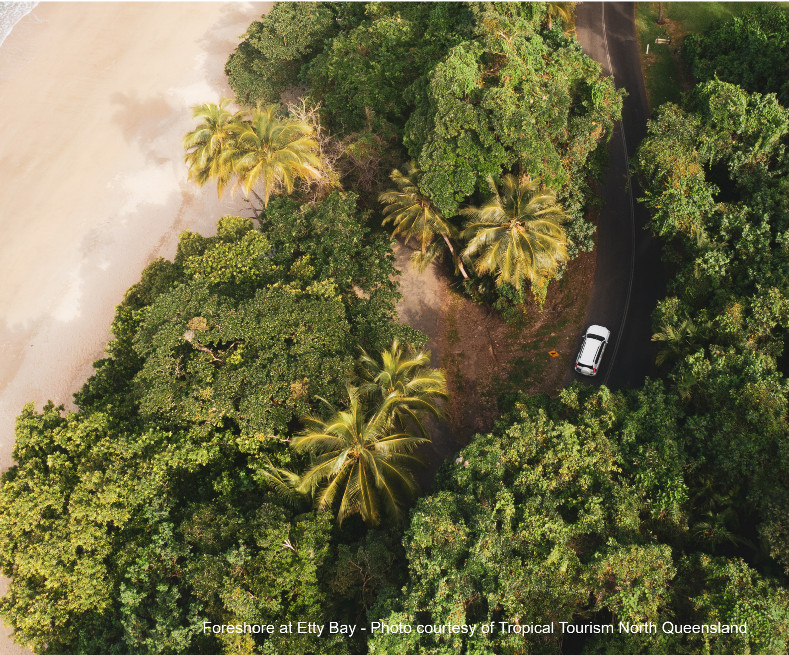
Foreshore at Etty Bay